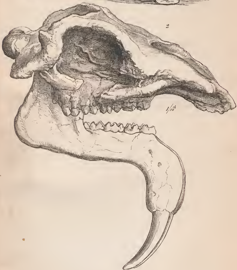
1. Restoration of Dinotherium , see p. 603.